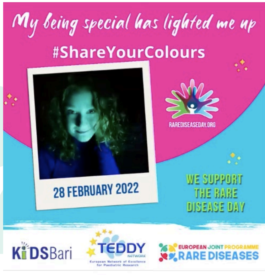
Figure 2. Preview of the video

The video was shared through the TEDDY social media channels and contacts.